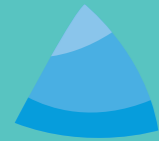
Gwersyll yr Urdd Llangrannog