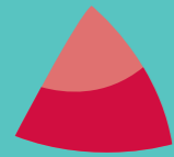
Canolfan yr Urdd Pentre Ifan